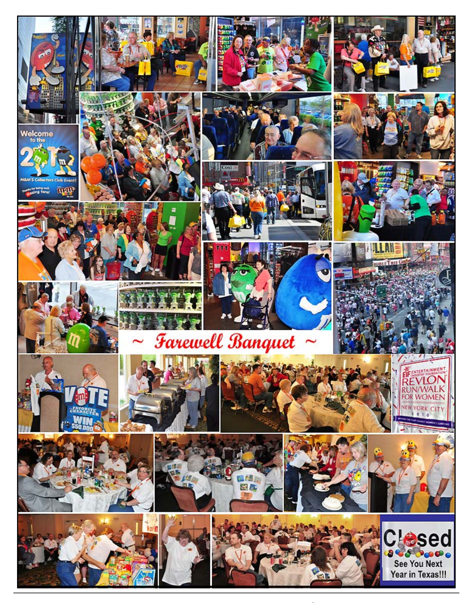
The M&M'S® Collectors Club 2010 Convention / 8