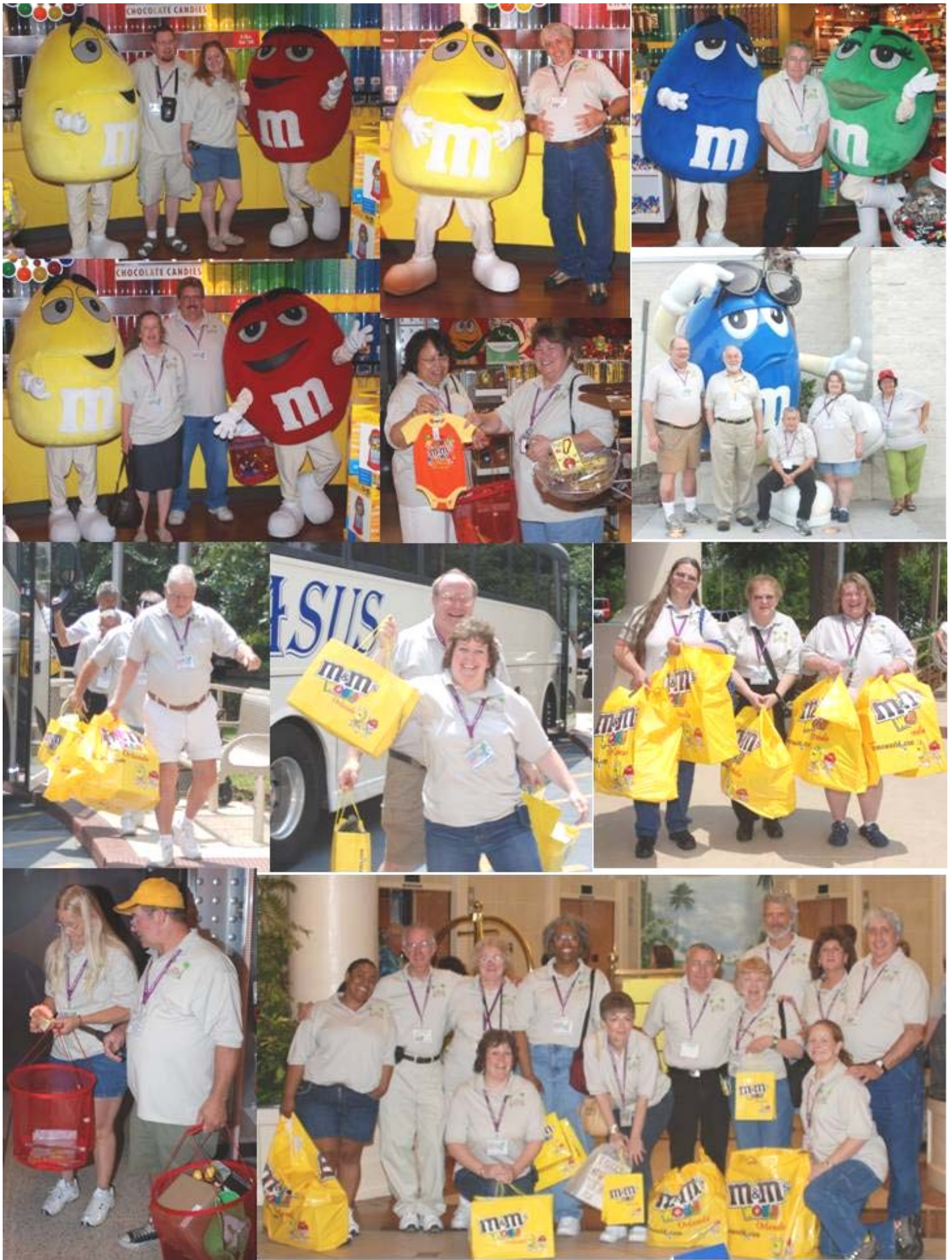
The 2007 M&M'S® Collectors Club Convention