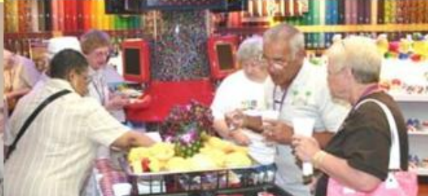
The 2007 M&M'S® Collectors Club Convention